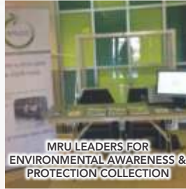
MRU LEADERS FOR ENVIRONMENTAL AWARENESS & PROTECTION COLLECTION