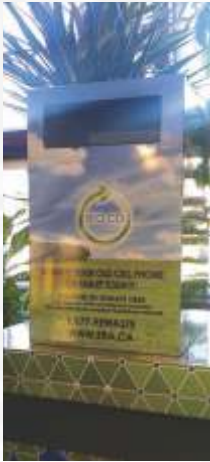
Cell Phone Bin

The ERA can provide a variety of collection receptacles for ongoing use, at no charge. These collection bins offer an accessible solution for disposing of unwanted computers and handheld devices. The ERA will deliver your choice of container, and place it in a location where they will be best utilized. The ERA will then set frequent pickup dates on an ongoing basis (e.g. weekly, monthly, quarterly, etc.) and/or pickup and empty (or replace) these receptacles when requested.