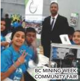
BC MINING WEEK COMMUNITY FAIR

Because awareness is often the biggest hurdle to overcome in the process of achieving a 100% diversion rate, the ERA works with numerous educational institutions. Through speaking engagements, volunteer fairs and collection events, it is our goal to ensure the next generation cares about a sustainable future.