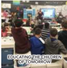
EDUCATING THE CHILDREN OF TOMORROW