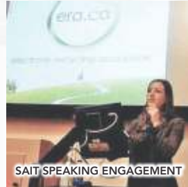
SAIT SPEAKING ENGAGEMENT